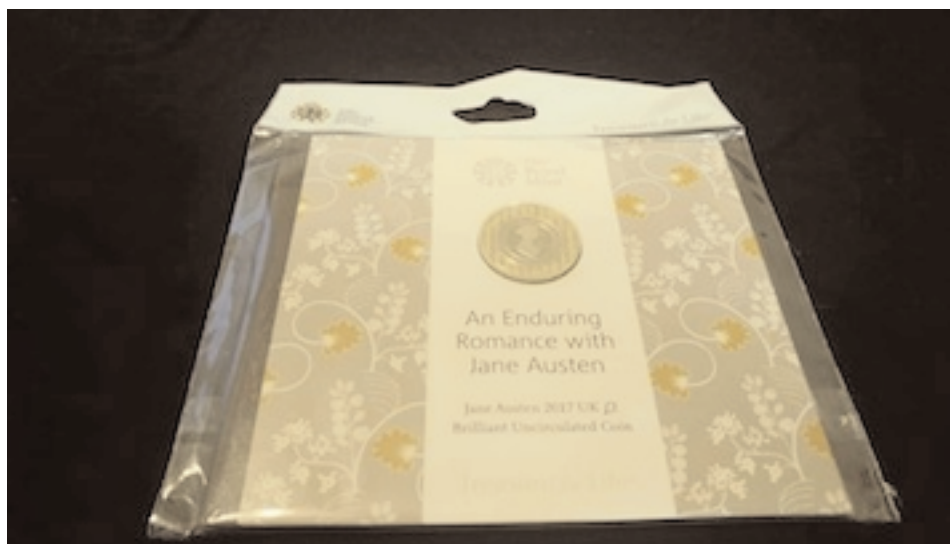
TOP: Swag from the AGM.