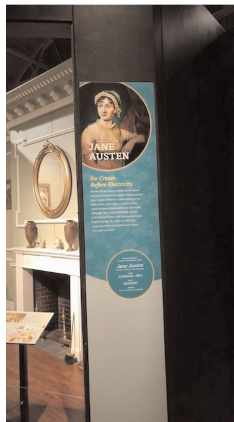
The Jane Austen exhibition at the Indiana State Fair, 2017.

Our September meeting took place at one of the two surviving Carnegie libraries in Indianapolis.